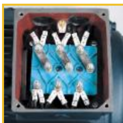
Globetrotter® Conduit Box and Terminal Block