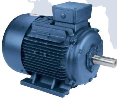
Globetrotter® IEC Cast Iron Frame