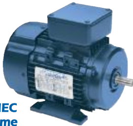
Globetrotter® IEC Aluminum Frame